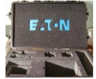
Complex Cutting Options